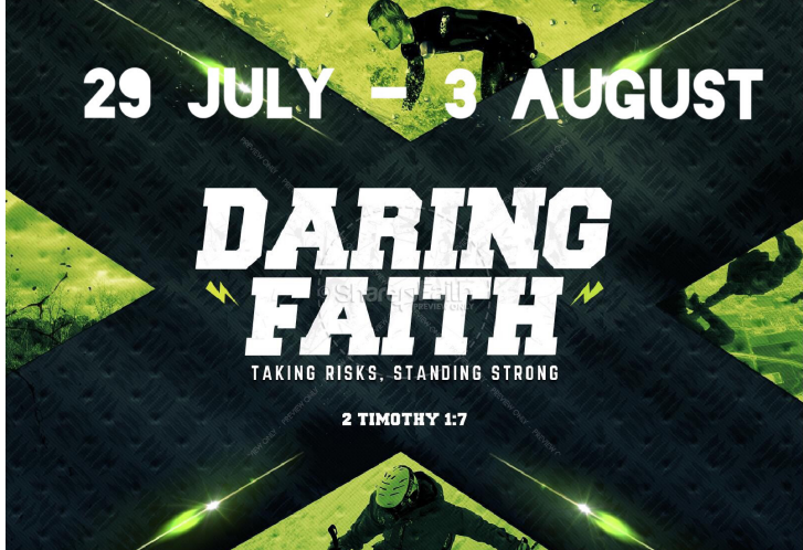
Excited to return to iYouth Camp for the third year to serve on the teaching team. This year, the camp is in southern Belgium and will host students from Belgium, Germany, Austria and Italy.